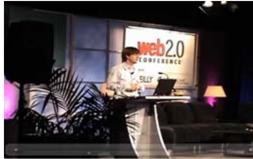
O'Reilly Web 2.0